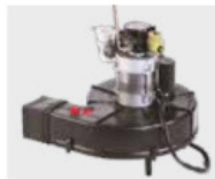
Unidad de ventilador de caldera separada