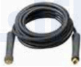
Rubber delivery hose extension kit