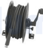
Hose reel with rubber hose