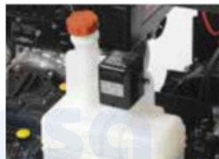
SOLO UNOS POCOS MODELOS ● Versiones con depósito de agua