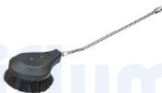
Rotating brush (max 60°C)