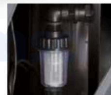
Puerta para inspección y limpieza del filtro de agua