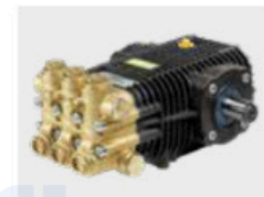
Bomba RW Premium con 3 pistones de cerámica y cabezal de bomba de latón